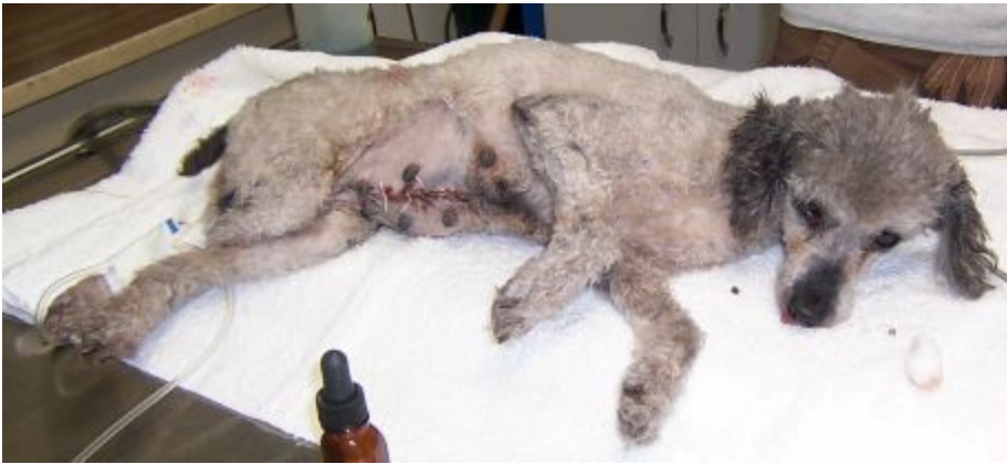
Photo of Miracle after surgery