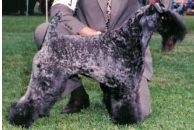
Champion Kerry Blue Terrier

Characteristics that are different between Kerry Blue Terriers and the other breeds are listed below.